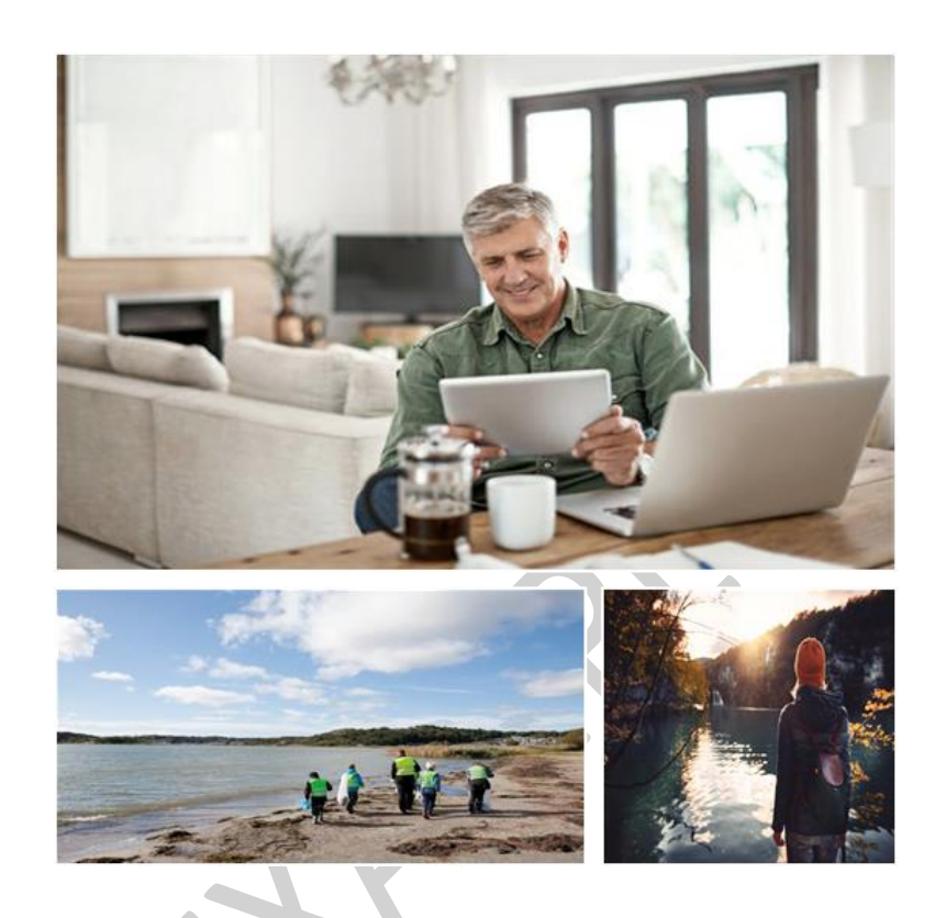
Option A - Take your pension benefits from the Scheme